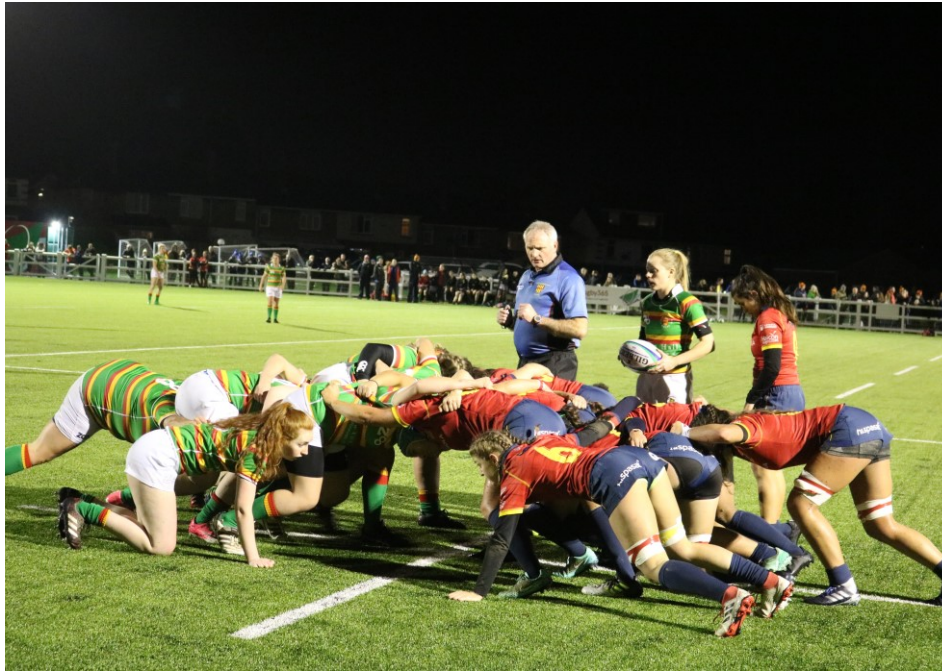
Spain Women's Development XV vs Northumberland County, Sky High Sports organised a winter training camp to Newcastle in 2018 for the Spanish National Women's side.