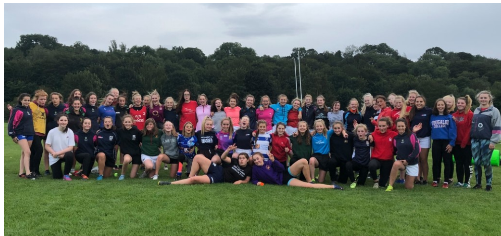
The 'Panthers' at Tynedale RFC are a thriving Girls section & will host the Festival at Tynedale Park on Sunday.