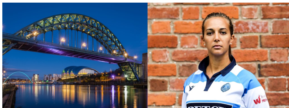
Newcastle Quayside is a stunning part of the city.