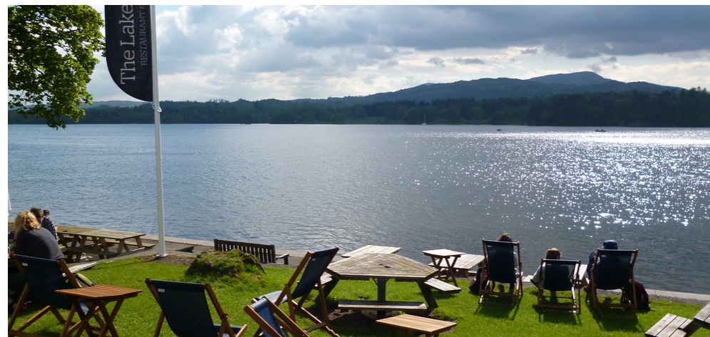
YHA Ambleside offers picturesque views across the stunning Lake Windermere

This tour base will be ideal for a pre-season training camp, a mid-season morale boost or a traditional end of season tour. It is simply fantastic for both young and old groups alike. With a great variety of traditional Rugby Clubs in the form of Carlisle RFC, Penrith RFC & Keswick RFC to name a few you will be in no shortage of an exceptional Rugby experience during your time away.