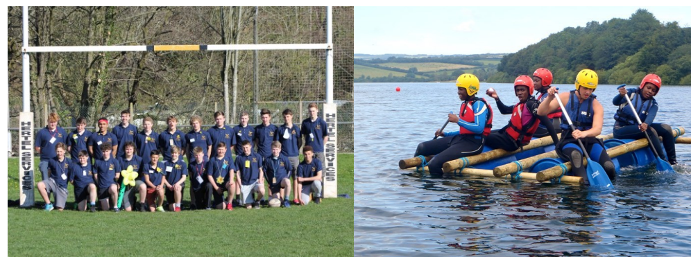
Yarm RFC U15's under the sticks at Upper Eden RUFC